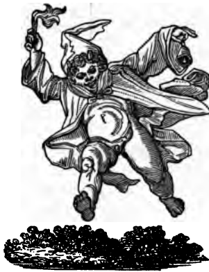
Alter et Idem.