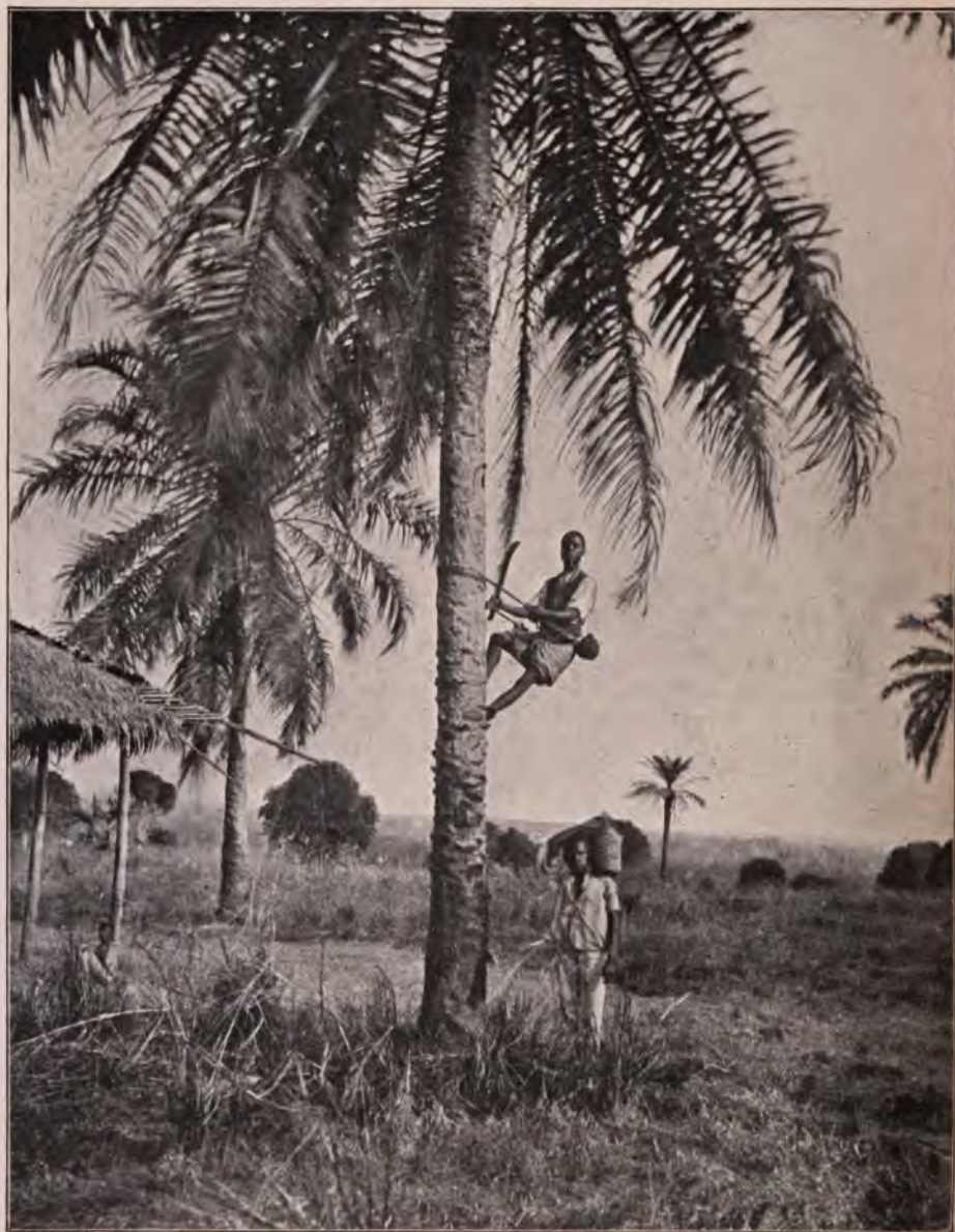
CLIMBING A PALM-TREE FOR PALM-WINE.