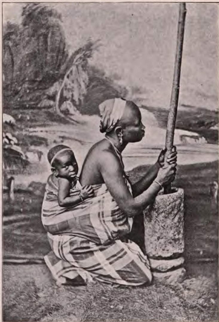
FJORT MOTHER AND CHILD.