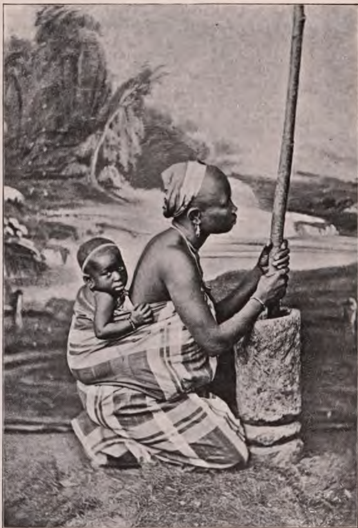
FJORT MOTHER AND CHILD.